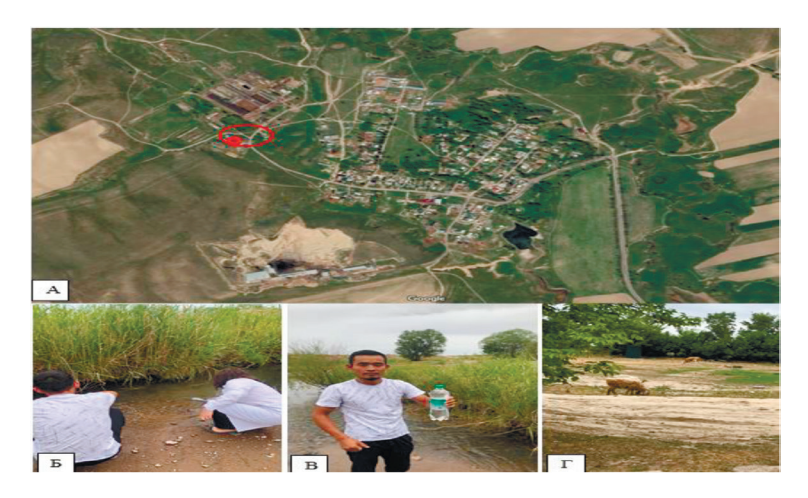
A – GPS coordinates: 43°16'55.9"N 76°19'58.9"E B, C – water sampling; D – polluted area where sheep graze

Figure 1 – The territory of the former pesticide warehouse in the village of Karakastek Zhambyl district of Almaty region