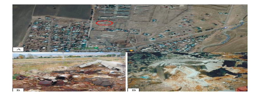
A – GPS coordinates: 43°08'25.7"N – 76°06'14.7"E B, C – pesticide contamination

In the village of Umbetali, the warehouse area is 100 sq. m., the warehouse building is destroyed. GPS coordinates: 43^{\circ}16'55.9"N - 76^{\circ}19'58.9"E . Residential buildings were built around the warehouse, there is a lake nearby where children bathe (Figure 2). According to the inventory data of 2008, the soil surface was contaminated with green substances of unknown origin, old plastic bags from pesticides were lying around [28]. The area is now privately owned. Currently, no pesticides have been found in this area.